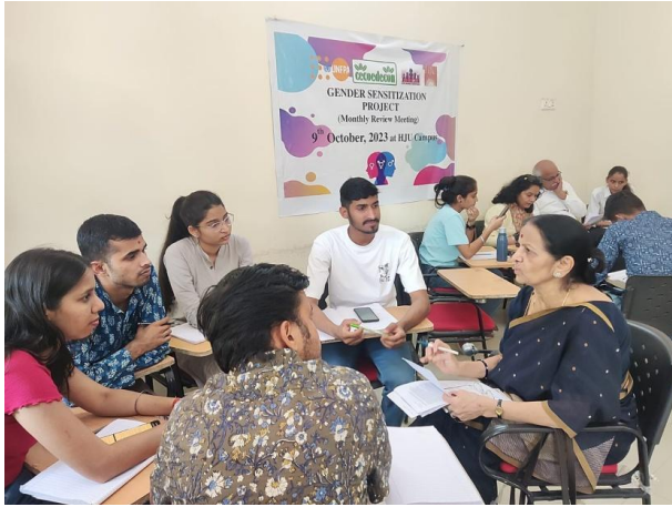
Group discussion with the resource person.