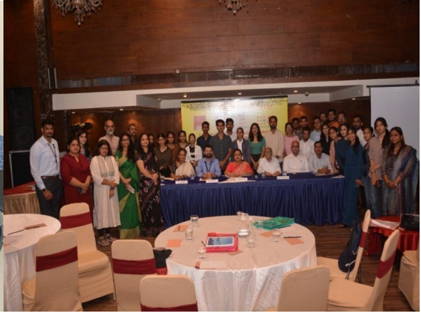
Group photo with the participants.