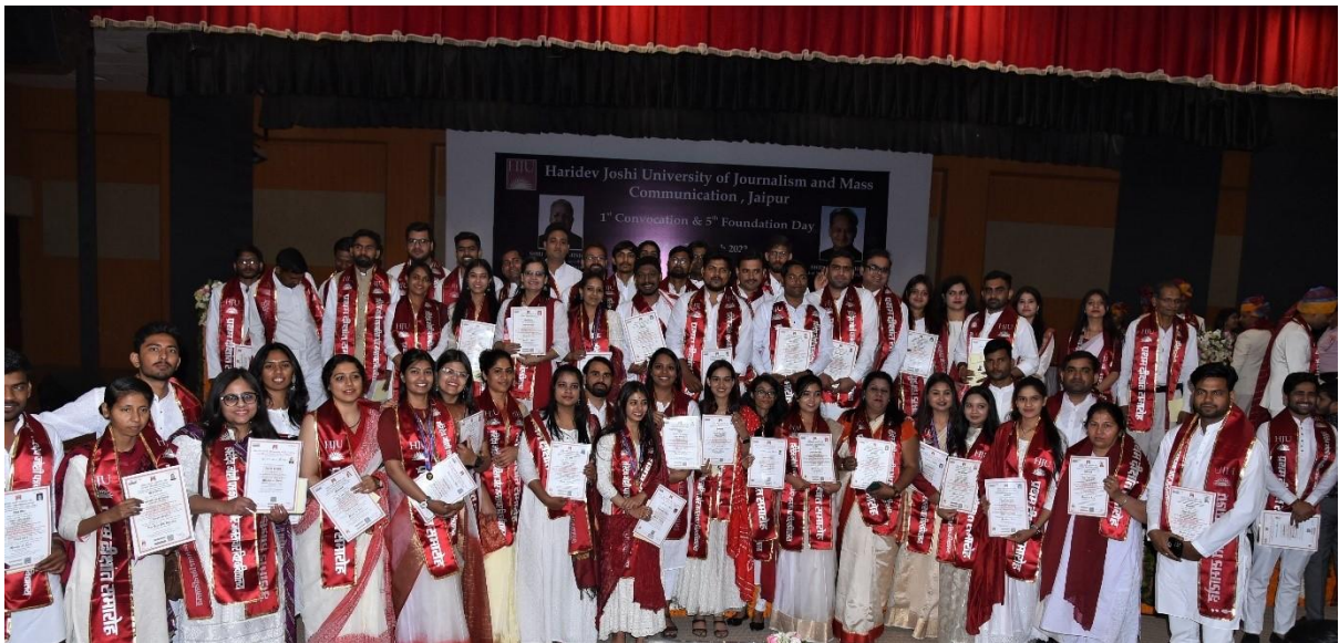
Group photo of students after being awarded degrees.