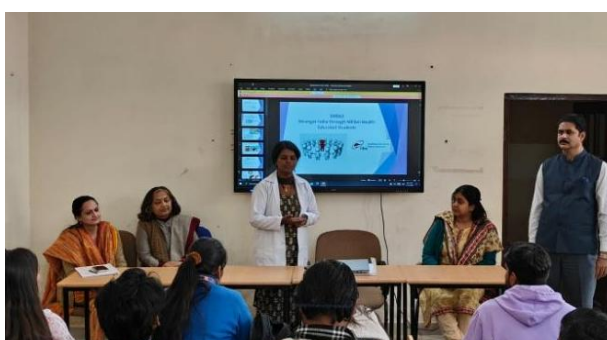
Seminar on Fatty Liver Awareness