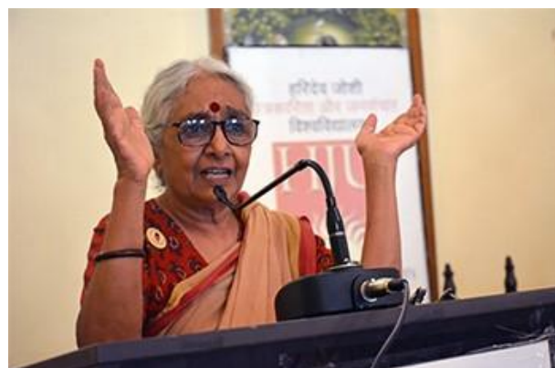
Social Activist Mrs. Aruna Roy delivering a lecture on RTI